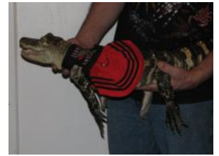
Alley dressed as a Trailblazer Cheerleader

ies, community festivals, day care, summer camps, Vacation Bible School, scouting events, business promotions, summer school, county fairs and just about any "family" orientated event that would like an attractive, well mannered, fashionably attired alligator.