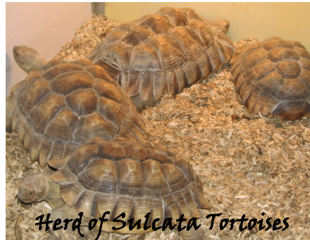
Herd of Sulcata Tortoises

Tortoises we recommend as pets are those that don't get too big like the